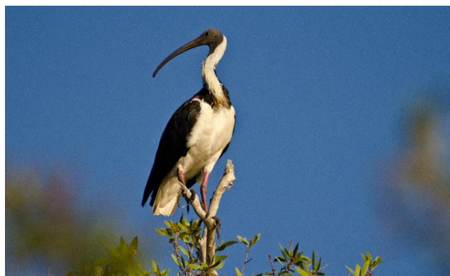
Straw-necked ibis – another member of the ibis family