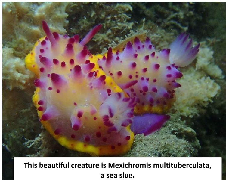
This beautiful creature is Mexichromis multituberculata , a sea slug.

Divers and underwater photographers around the world have a fascination with opisthobranchs, commonly referred to as nudibranchs or sea slugs.