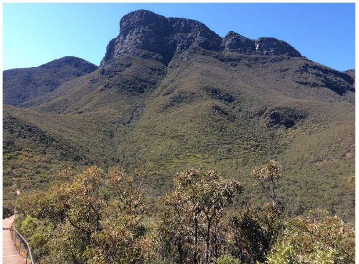
Rugged beauty of the Stirling Range

Enjoy the myriad of interesting places in this part of Australia by joining the audience on Friday March 6 at the NPA Environment Centre, 5 Wallace Drive Noosaville from 10am for coffee and conversation. The forum begins at 10.30am and concludes at 12.15pm. All are welcome and entry is by donation